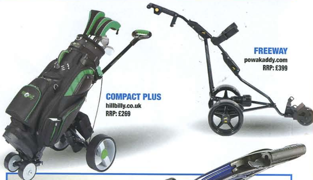
COMPACT PLUS hillbilly.co.uk RRP: £269

very latest new carts on the market, some of which you might not have seen before. From four wheelers, traditional push 'n' pull versions and the quite funky Tri-Bag design, we've got every kind of cart possible.