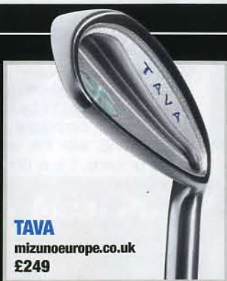
TAVA mizuno-europe.co.uk £249

Ladies, remember to get your new gear custom-fitted by a fully-trained fitting technician.