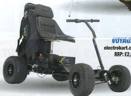
VYAGER electrocart.com RRP: £2,050