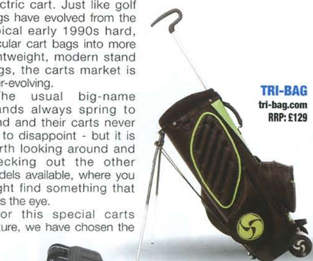
TRI-BAG tri-bag.com RRP: £129