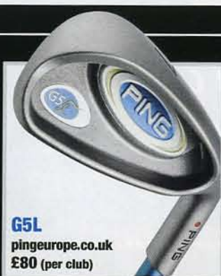
G5L pingeurope.co.uk £80 (per club)