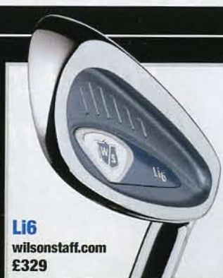
LI6 wilsonstaff.com £329