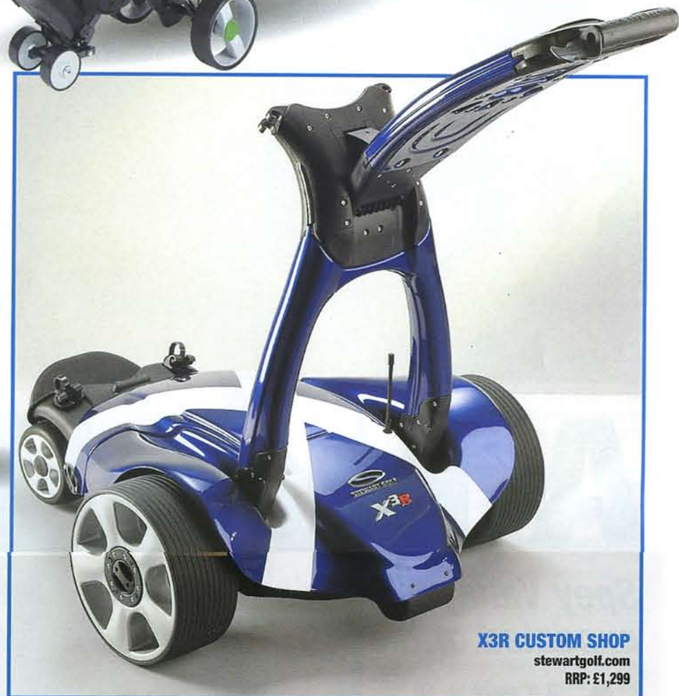
X3R CUSTOM SHOP stewartgolf.com RRP: £1,299