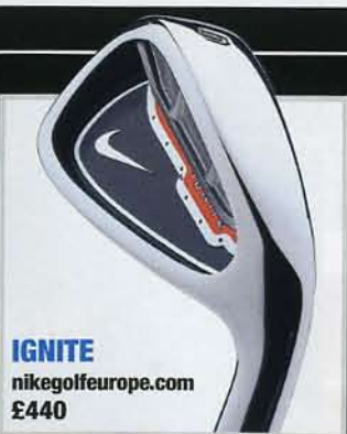
IGNITE nikegolfeurope.com £440